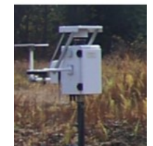
NCON Chimney Style Collector

* Contact the vendor for most up to date equipment costs