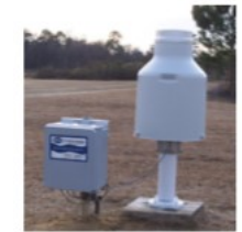
Hach Pluvio 2 Gage