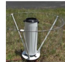
ETI Rain Gage