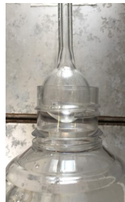
Figure 1. New bottle with thistle tube

You may have noticed some recent issues with the MDN sample bottles and the glass thistle bulbs (Fig.1). Due to the ongoing supply chain issues, we had to purchase the 1L PETG bottles from a different supplier. Unfortunately the mouth of the new bottle is slightly larger than the previous bottles, as a result the bulb on the thistle tube can fit into the bottle opening. As a temporary solution, starting this week, the HAL is shipping out an extra cap in each cooler. The caps have been drilled out and cleaned for use. Continue to use the new bottles, and line up the widest part of the bulb with the bottle opening.