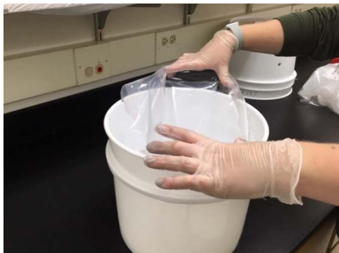
Figure 3. Open the sample bag starting at the top of the bag.