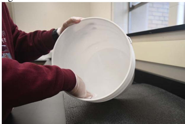
Figure 2. Cleaning sample bucket.