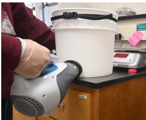
Figure 6. Apply the vacuum to pull the sample bag to the walls of the NTN bucket.