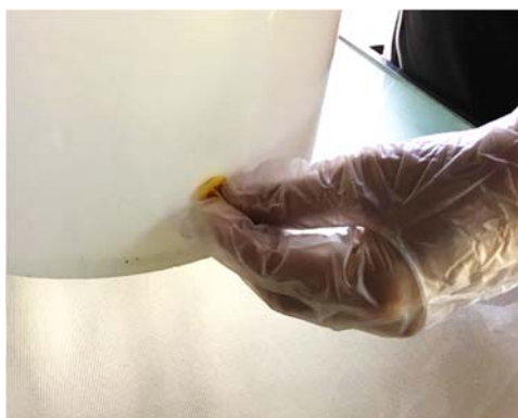
Figure 8. Insert bucket plug in the hole on side of NTN bucket to prevent water from entering.