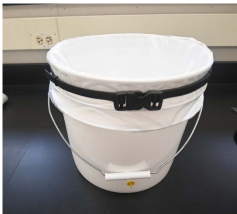
Figure 7. NTN bucket and sample bag ready for deployment.