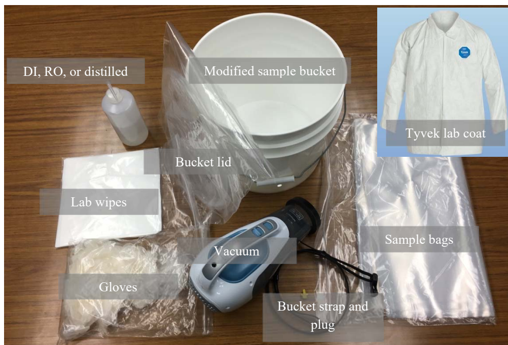
Figure 1. Items needed to deploy sampling bag.

Instructions – Sample Bag Preparation: Complete these steps before going to the field to deploy the new sample bucket.