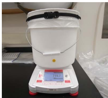
Figure 9. Weigh NTN bucket, sample bag, bucket strap and bucket plug