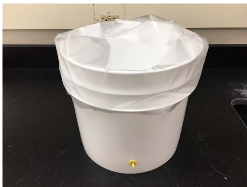
Figure 4. Drape excess sample bag over edge of NTN bucket.