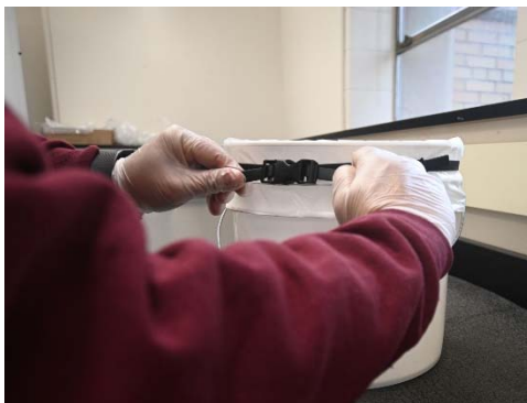
Figure 5. Wrap strap around NTN bucket and cinch to secure the sample bag.