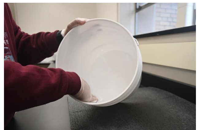
Figure 2. Cleaning sample bucket.

1. Clean the NTN bucket. Wet a laboratory wipe with deionized water and wipe the rim, and inside and outside surfaces of the bucket. Do this each time before a deploying a new sample bag.