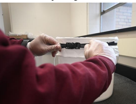
Figure 5. Wrap strap around NTN bucket and cinch to secure the sample bag.

4. Wrap the strap around the side of the NTN bucket to secure the sample bag to the bucket. This helps prevent air leaks when the vacuum is applied in the next step. Place the strap around the bucket just below the lip of the bucket, aligning the buckle above the bucket hole. Cinch the strap to ensure a good seal. Avoid contact between the strap and the inside collection surface of the sample bag.