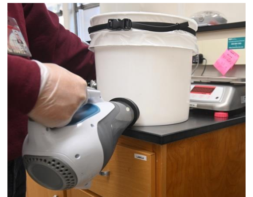
Figure 6. Apply the vacuum to pull the sample bag to the walls of the NTN bucket.

5. Locate the vacuum hole in the side of the bucket. Apply the handheld vacuum to this opening to form the sample bag to the walls of the NTN bucket. A handheld portable vacuum is included as part of the start-up kit.