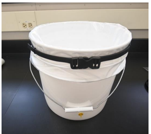
Figure 7. NTN bucket and sample bag ready for deployment.

6. Excess bag on the outside of the bucket should lie flat. Folds and pockets in the excess bag on the outside of the bucket will trap water. This will cause the sample mass to be reported incorrectly, and may contaminate the sample when it is decanted to the shipping bottle. Ensure the strap lies flat by using the o-rings to hold the excess strap. Figure 7 illustrates the NTN bucket with the sample bag ready for deployment.