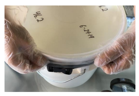
Figure 11. Place lid on NTN bucket and secure to protect sample bag.

11. Use a new unused lid (in protective bag) and place on the prepared bucket to protect the sample bag during transport to the site. Take the protective bag with you to the site to store the lid in it once the bucket is deployed.