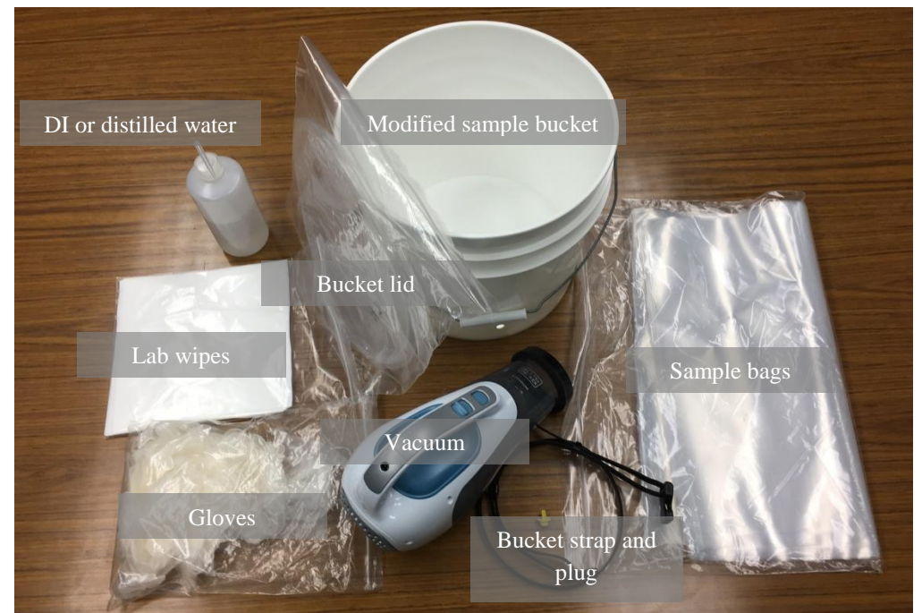
Figure 1. Items needed to deploy sampling bag.

Instructions – Sample Bag Preparation: Complete these steps before going to the field to deploy the new sample bucket.