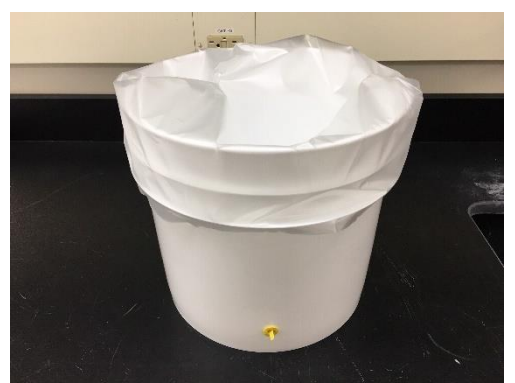
Figure 4. Drape excess sample bag over edge of NTN bucket.

Wisconsin State Laboratory of Hygiene NADP Program Office Revision Date: 11/25/2020