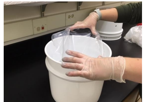
Figure 3. Open the sample bag starting at the top of the bag.

2. Put on a new pair of clean, laboratory gloves. Remove the bucket plug and set aside. Remove a sample bag from the zippered pouch. Open the sample bag by pulling the sides open, starting at the top of the bag and working downward toward the seam. Insert the bag into the bucket by aligning the bottom seam of the bag with the bucket handle attachment points.