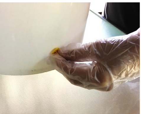
Figure 8. Insert bucket plug in the hole on side of NTN bucket to prevent water from entering.

7. Insert the bucket plug in the opening on the side of the NTN bucket to prevent water from entering the bucket. Water between the sample bag and the walls of the bucket will cause the sample mass to be reported incorrectly. It is normal for the bag to collapse slightly after removing the vacuum source.