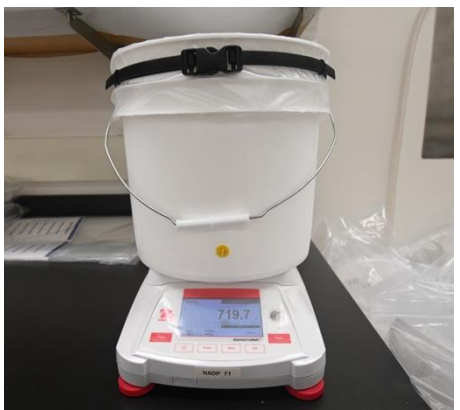
Figure 9. Weigh NTN bucket, sample bag, bucket strap and bucket plug

Wisconsin State Laboratory of Hygiene NADP Program Office Revision Date: 11/25/2020